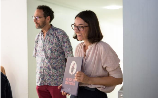
This workshop was led by the association Yad Leyeled-L'Enfant de la Shoah to introduce the exhibition "Sur les traces d'une photo".