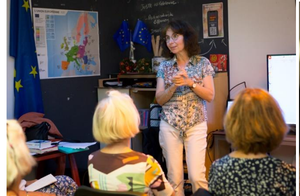
Workshop 4: Initiation to the Yiddish language